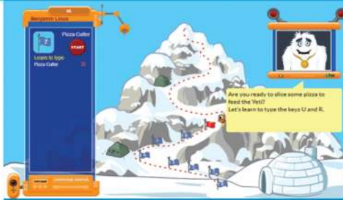
Students Climb K2 Mountain